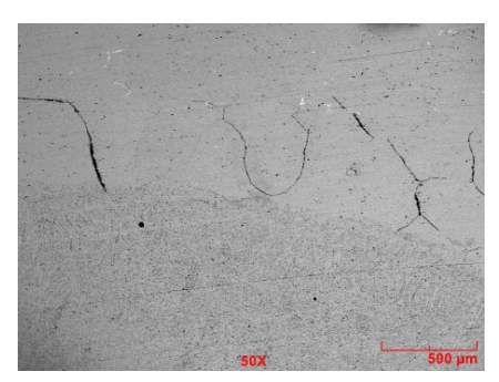
Another area along the fusion line showing cracking at 50X.

Although this material is specified in some applications where critical (such as pressure containing) welds will be required, practical studies conducted by MOGAS in partnership with some customers have determined that successful welds are difficult if certain material requirements are not controlled beyond what the specification allows.