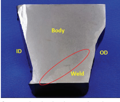
Cross-section showing the area along the fusion line examined microscopically.